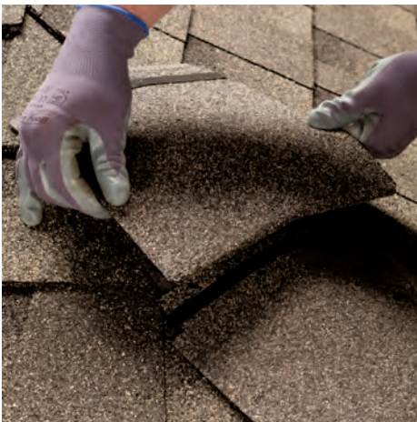
Place on the hip or ridge according to the 8" (203 mm) exposure notch