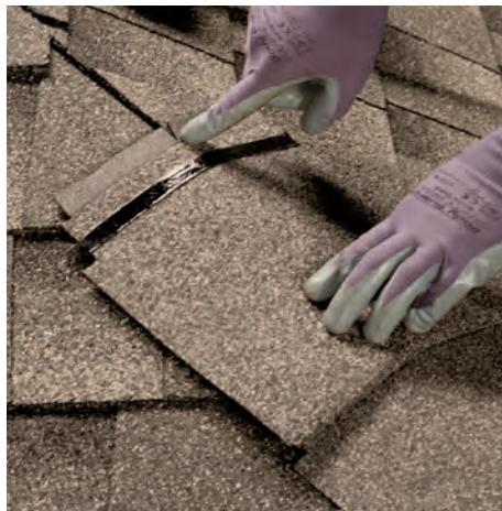
Center over the hip or ridge using the alignment guide